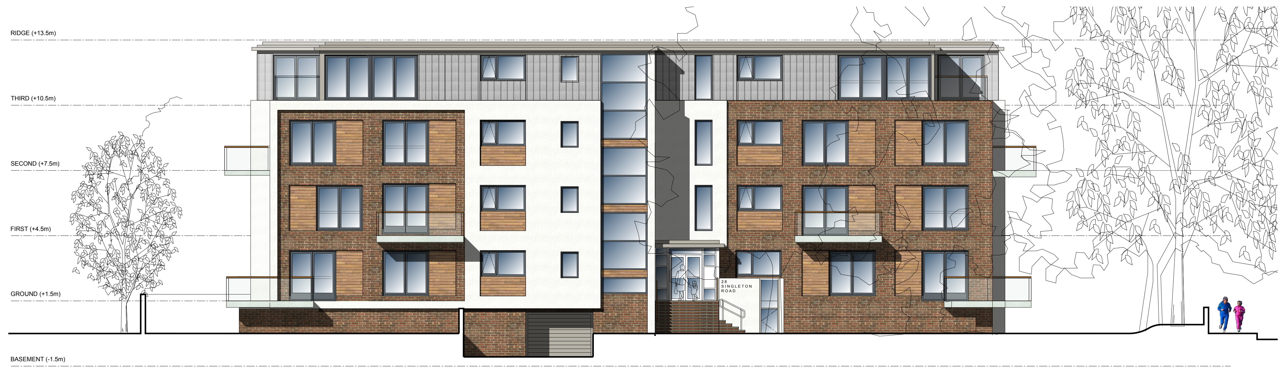
EAST ELEVATION (FACING HOLDEN ROAD)