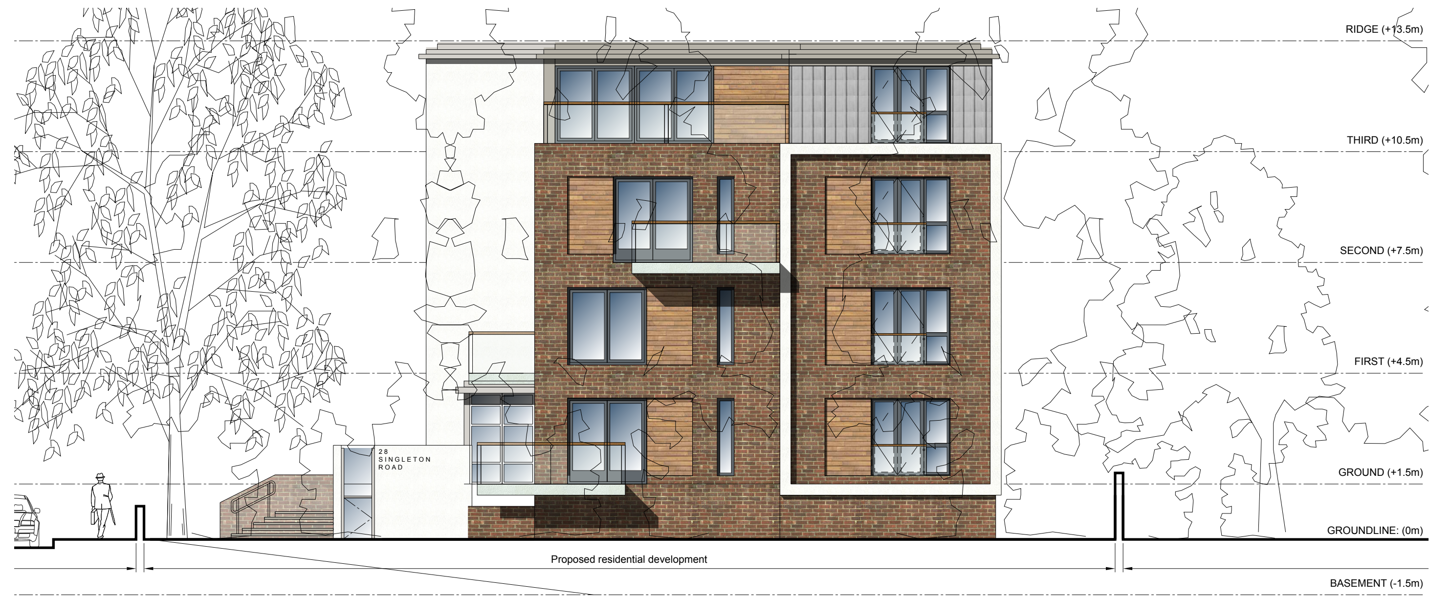
NORTH ELEVATION (FACING SINGLETON ROAD)