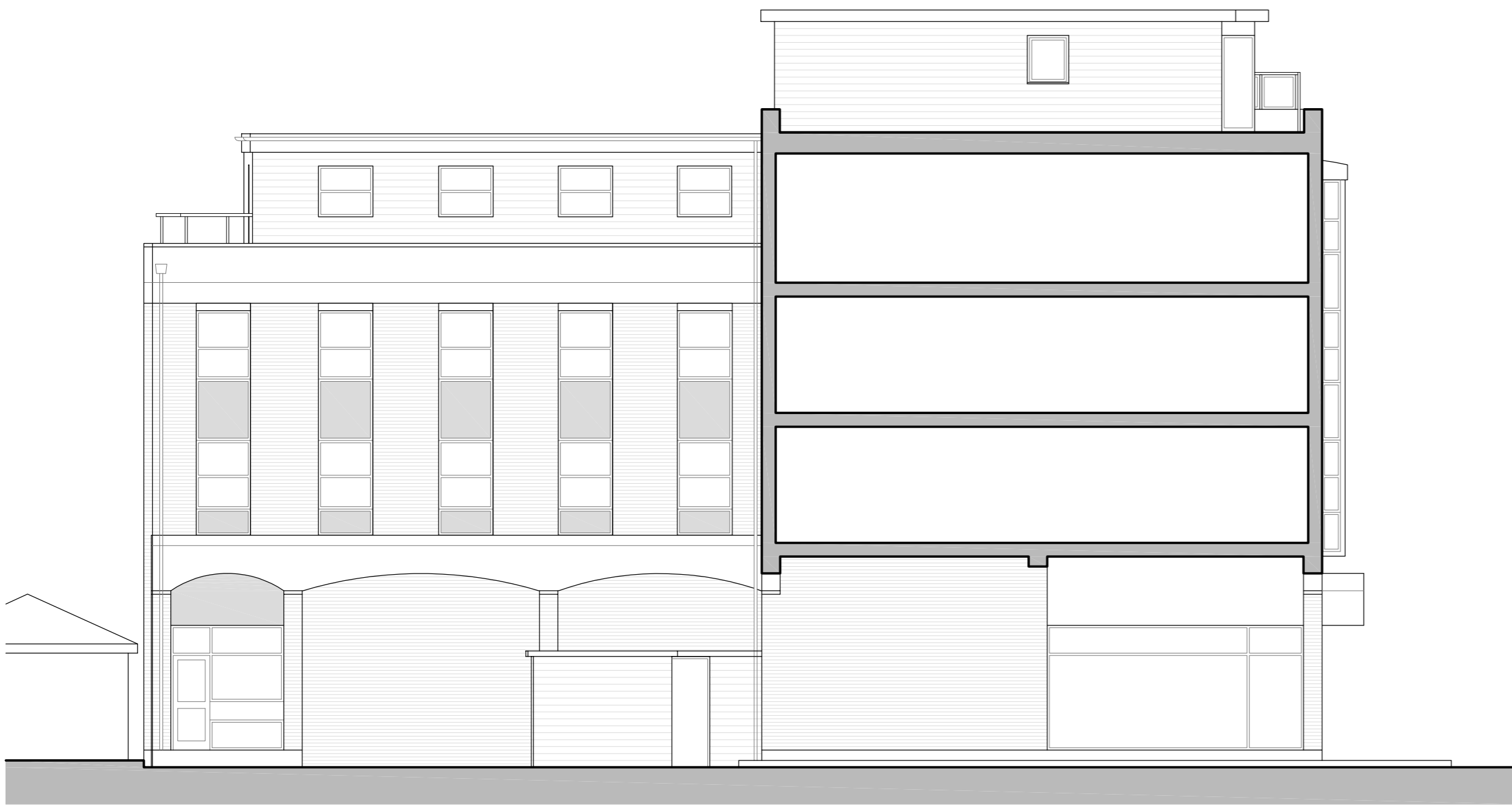
Existing South Elevation / Section A-A'