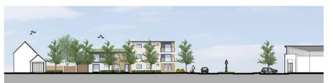
STREETSCENE B/B - CLOCK TOWER ROAD