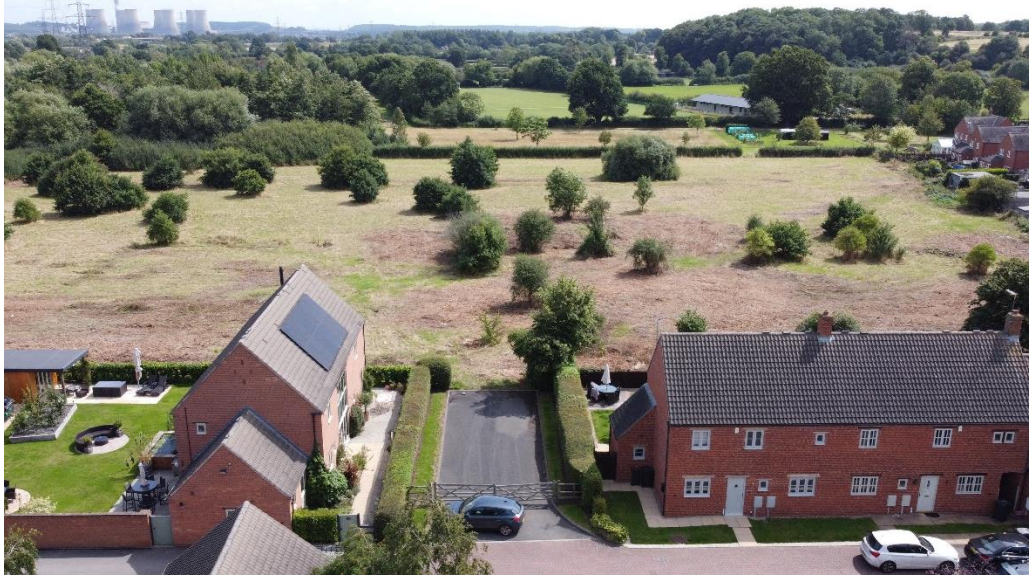
Indictative purposes only