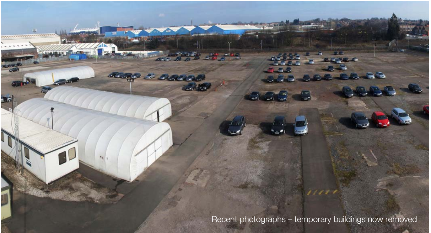
Recent photographs – temporary buildings now removed

1.34 acres (0.54ha) to 6.6 acres (2.67ha)